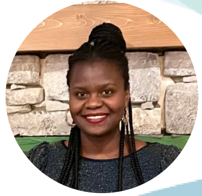
Magnifique Umutoni Family Access Services Facilitator